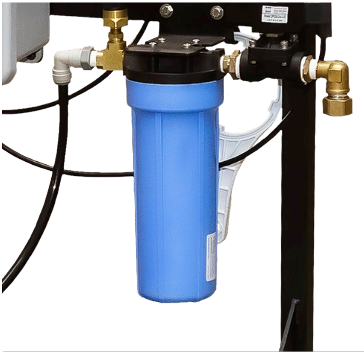
Pre-filter housing with inlet solenoid and inlet connection