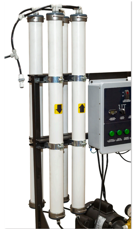
Freshwater reverse osmosis membranes with permeate outlet and sampling port